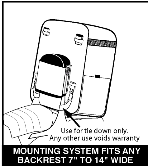
MOUNTING SYSTEM FITS ANY BACKREST 7" TO 14" WIDE