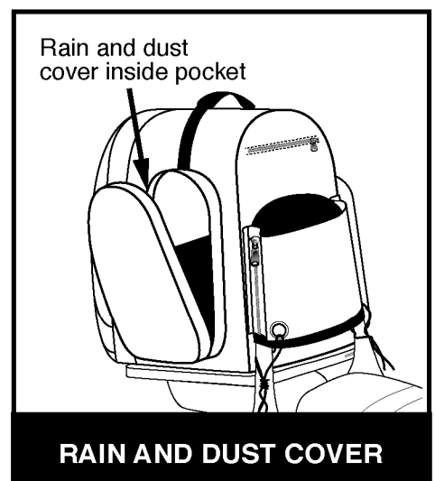
Rain and dust cover inside pocket

TIE DOWN LACES: After the packed bag is in place on the motorcycle, lace the tie down laces around the backrest support as shown in the drawings above. Do not cross the tie down straps. Do not strap both straps around any single post backrest. Each strap must be hooked independently -one on the left and one on the right side of the metal backrest support or other secure tie down points. With the bag in place, you may cut the security straps to a convenient length and burn the ends with a match to avoid fraying. All loose straps must be shortened and/or tied off and tucked in to avoid entanglement in moving parts of the motorcycle and to prevent paint damage from flapping straps